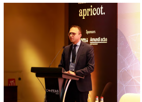
Armen Nurbekyan Deputy Chairman - CBA

I think it's incredibly important to acknowledge, that the development of capital market is strategic priority for the Central Bank and Government together. As a regulator and as a Central Bank we want the capital market to develop. I think the key success for the development of capital markets, is basically the organic marriage between the predictable microeconomic environment and technology – these are the two pillars to build on the development of capital markets.